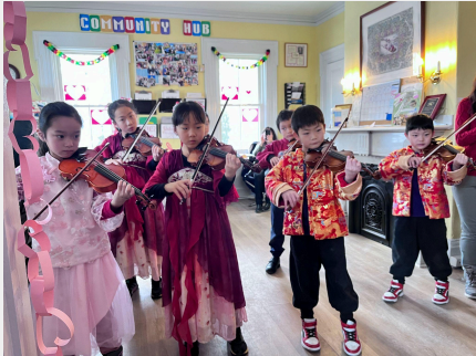
Visit from the Mindful Musicians on 2/14!