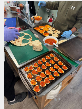
Heart-shaped pizza coming to life!