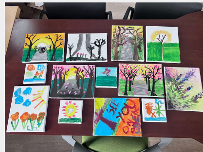
Artwork from our February Guided Painting social!

**Clubhouse International is a global organization working to end social and economic isolation for people with mental illness, through its network of 330 Clubhouses in 34 countries. Clubhouses offer resources and opportunities for recovery through friendship, employment, education, wellness, and social programs.